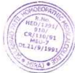
Principal Gulabrao Patil Homoeopathic Medical College, Miraj.