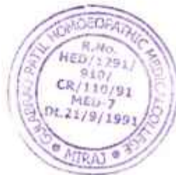
Principal Gulabrao Patil Homoeopathic Medical College, Miraj.